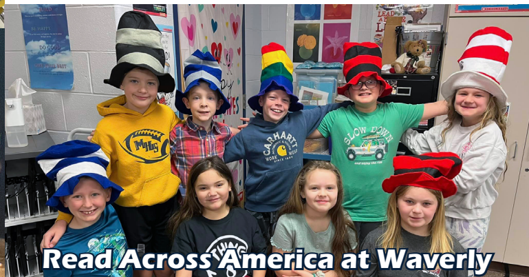
Read Across America at Waverly