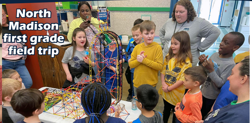
North Madison first grade field trip