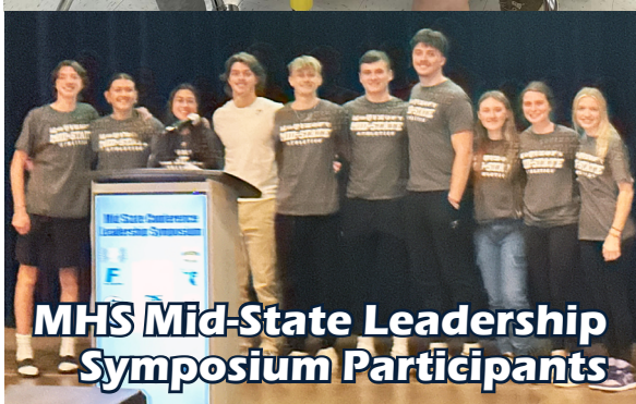
MHS Mid-State Leadership Symposium Participants